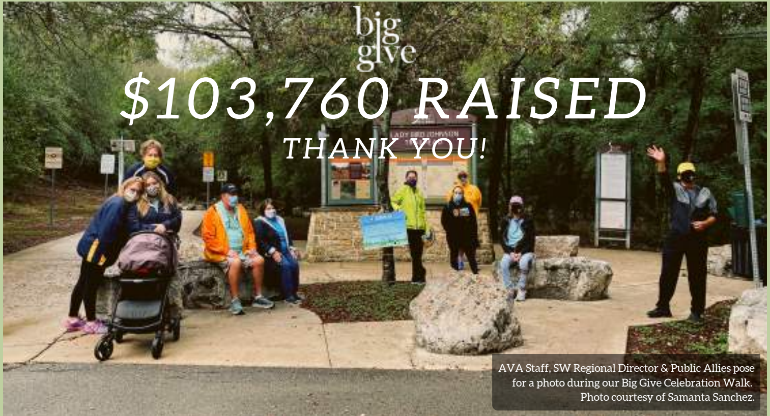
AVA Staff, SW Regional Director & Public Allies pose for a photo during our Big Give Celebration Walk.