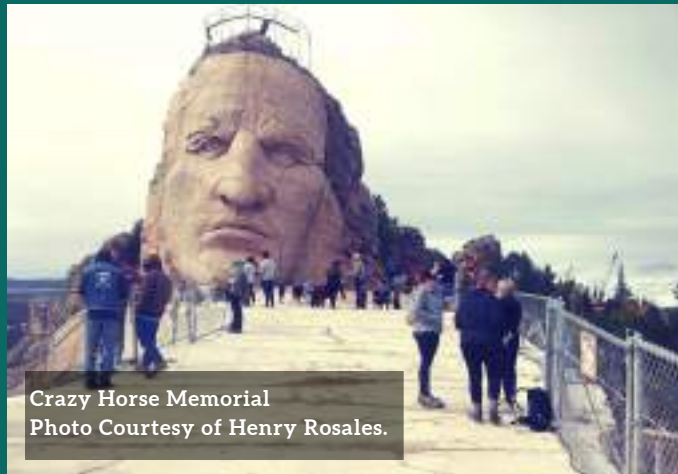
Crazy Horse Memorial